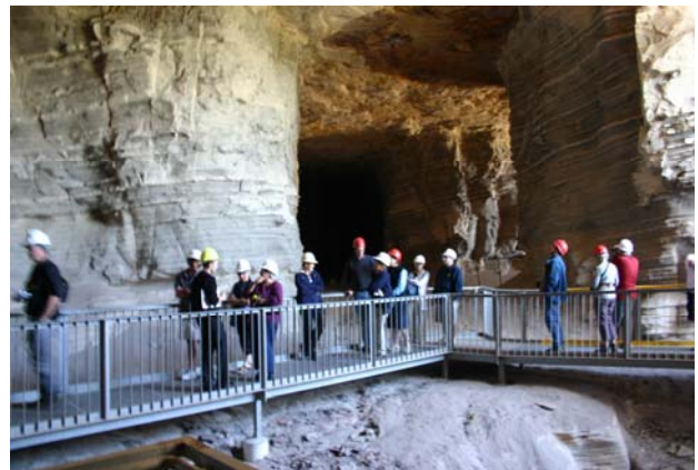
Members in the Fire Clay Caverns, Mt. Morgan

While some members departed, many stayed on till the Monday to do the Mt. Morgan trip. We bussed off first thing, and upon arrival members looked around the historic township. At 12.30pm we departed on a tour of the old Mt. Morgan Mine site, and the wonderful Fire Clay Caverns with their stunning dinosaur footprints in the ceiling. Many management issues were discussed, to say the least. I will not dilate here, but refer you to my previous article (the contents of which remain pertinent) – The Fire Clay Caverns of Mt. Morgan – in ACKMA Journal 56 (September 2004). This article is on the ACKMA Web Site.